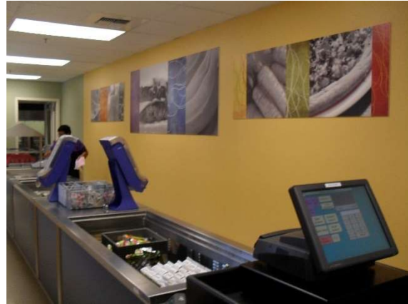
Benicia Unified School District, CA