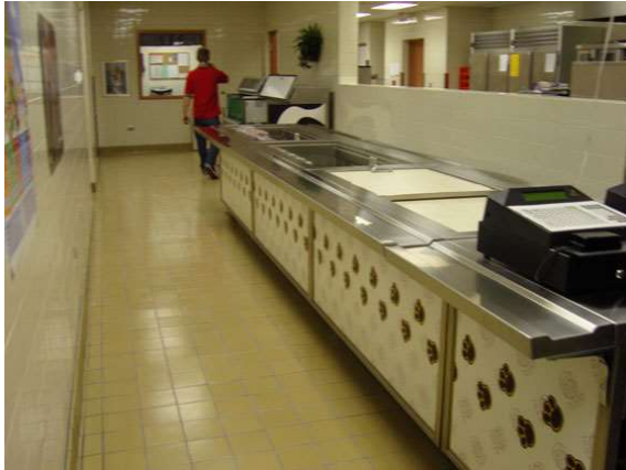
Gilbert Public Schools, AZ