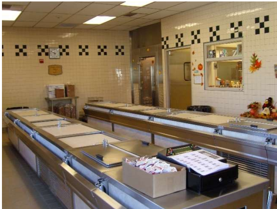
Desert Sands Unified School District, CA