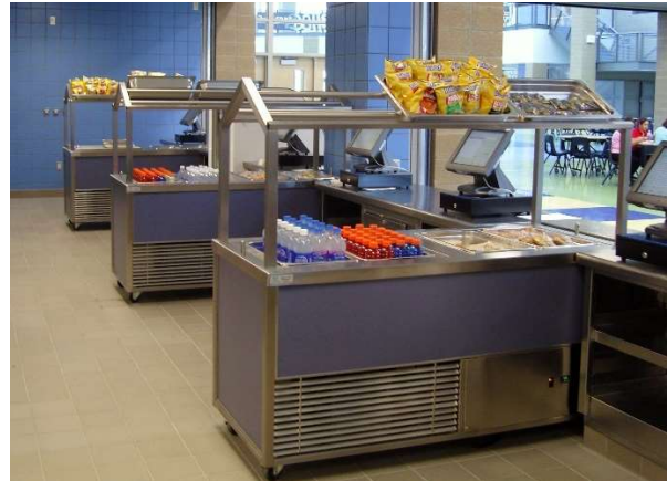
Clark County School District, NV

226 W. Carleton Ave. Orange, CA 92867 sales@gasystemsmfg.com www.gasystemsmfg.com P: 714-848-7529 F: 888-596-0387