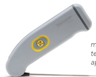
mobile temperature application