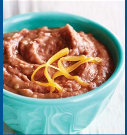
LOWER SODIUM Smart Servings™ Vegetarian Refried Beans – Low Sodium SKU 10302