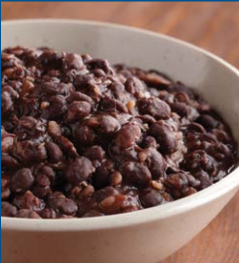
AUTHENTIC Seasoned Vegetarian Black Beans SKU 60045