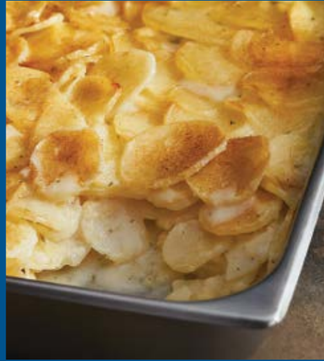
LOWER SODIUM Scalloped Potato Casserole – Reduced Sodium SKU 94595