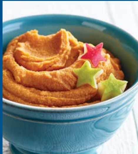
SWEET AND SAVORY Mashed Sweet Potatoes SKU 10861