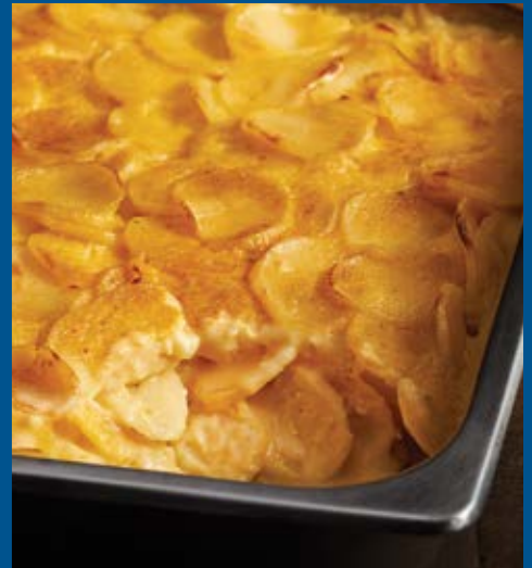
LOWER SODIUM Au Gratin Potato Casserole – Reduced Sodium SKU 20922

WE'D LOVE TO HEAR FROM YOU! Questions? Comments? Want to try a sample or request a menu photo? Share your favorite recipes and tell us how we can make your job easier and our food even better. baafoodservice.com/k-12