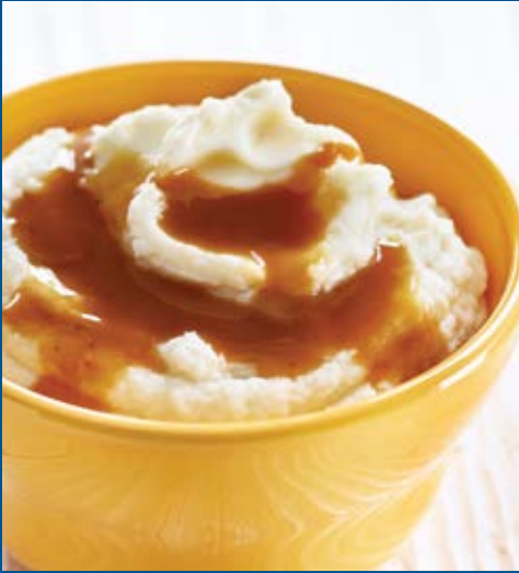
LOWER SODIUM EXCEL® Original Butter Mashed – Reduced Sodium SKU 10799