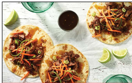
J.T.M. #CP5887 | GS #405757 Sous Vide Beef