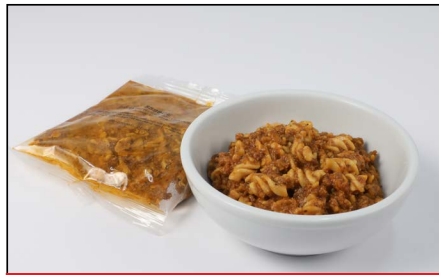
J.T.M #5599CE | GS #141489 Rotini w/ Meat Sauce 8 oz. Pouch