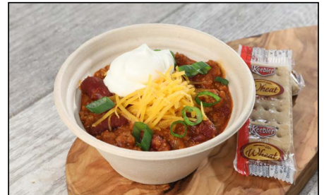
J.T.M. #CP579 | GS #401100 Beef Chili (GF)