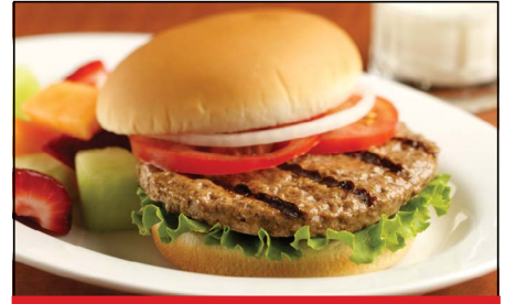
J.T.M. #CP5670 | GS #401765 Premium Beef Patty