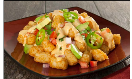
J.T.M. #5724 | GS #406761 Red. Fat Jalapeno Cheese Sauce