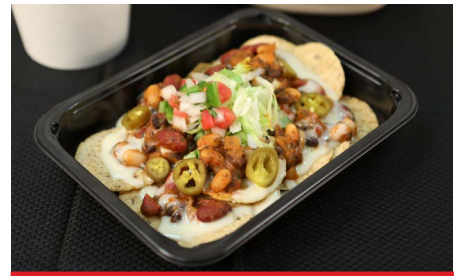
J.T.M. #5383 | GS #403993 3 Bean Chili (AF + GF)