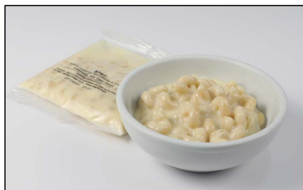
J.T.M #5797 | GS #409654 Premium Three Cheese Mac 8 oz. Pouches