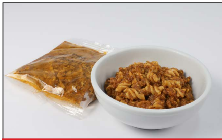
J.T.M #5599CE | GS #141489 Rotini w/ Meat Sauce 8 oz. Pouch