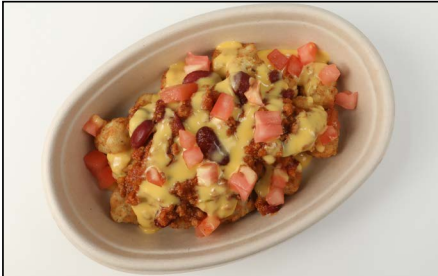
J.T.M. #5705 | GS #402116 Premium Cheese Sauce (GF)

Create easy-to-portion, portable meals with these bulk-packed products that are currently stocked and ready for your menus • Click the image to learn more.