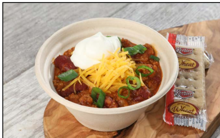
J.T.M. #CP579 | GS #401100 Beef Chili (GF)