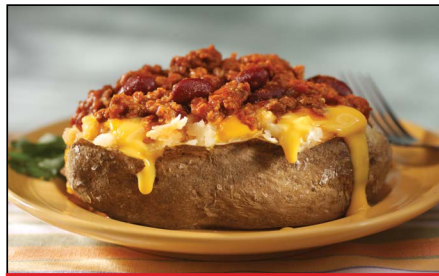
J.T.M. #CP5309 | GS#406815 Beef Chili (AF + GF)