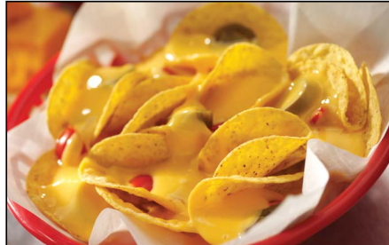
J.T.M. #5708 | GS #402117 Jalapeno Cheese Sauce (GF)