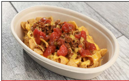
J.T.M. #5254 | GS# 403937 Turkey Taco Filling (GF)