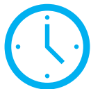
School Day Meals

Food for Good offers a wide range of meal solutions to ensure children have access to nutritious meals no matter where they are or the time of the year. We collaborate with a wide range of partners, including the U.S. Department of Agriculture (USDA), Share Our Strength, community-level partners nationwide and many others to address food insecurity in vulnerable communities.