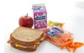
Lunch & Dinner