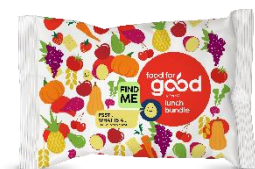
Lunch & Dinner Bundle