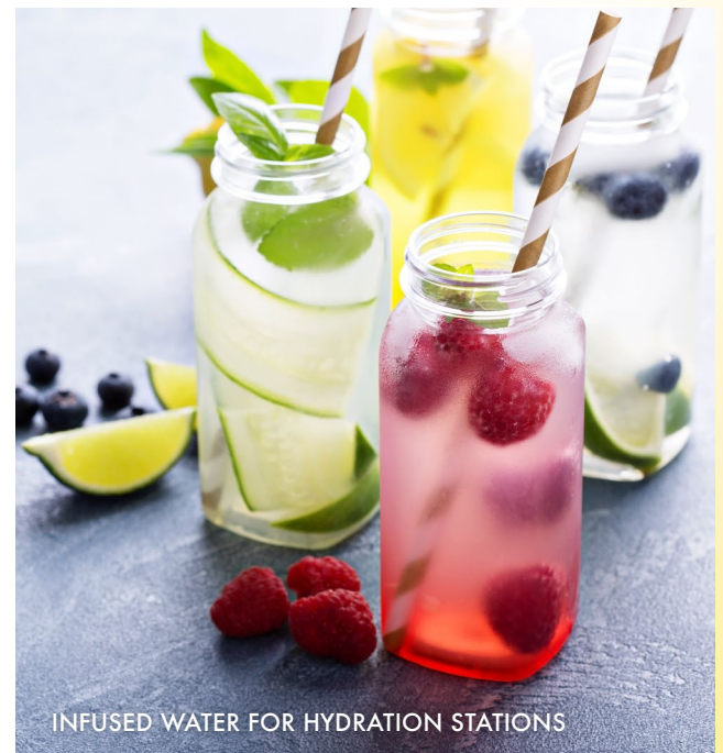
INFUSED WATER FOR HYDRATION STATIONS